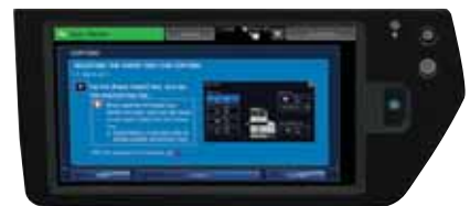
Access User Manual directly from MFP panel