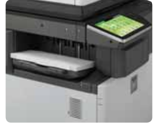
Space-saving inner finisher option