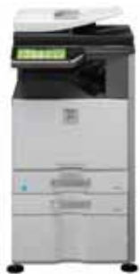
Base Unit Exit Tray Unit Stand with 500-Sheet Paper Drawer