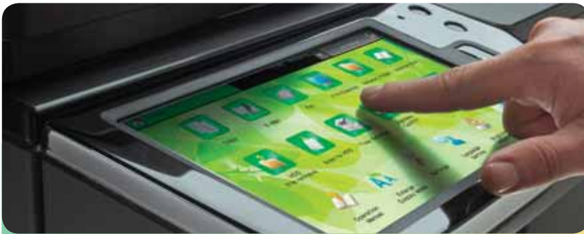
Finger-swipe touch control for intuitive operation of every function

Similar technology has already revolutionised smart phones and tablet PCs. Simply touch or tap the screen, then flick or slide for fingertip control of every document, function and setting. Using a digital interface has never felt so natural.