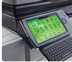
Tiltable panel with retractable keyboard option