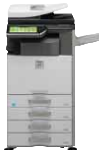
Base Unit Finisher Exit Tray Stand with 3 x 500-Sheet Paper Drawers