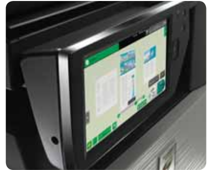
Tilting finger-swipe control panel* for easy page previews and editing