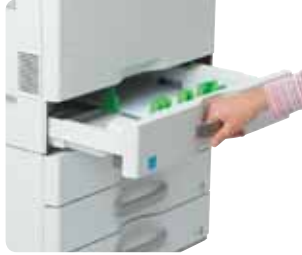
Easy-grip drawer handles