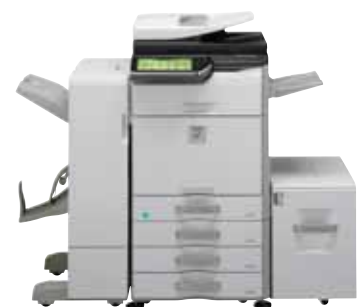
Base Unit Stand with 3 x 500-Sheet Paper Drawers Saddle Stitch Finisher + Paper Pass Unit Exit Tray Large Capacity Tray