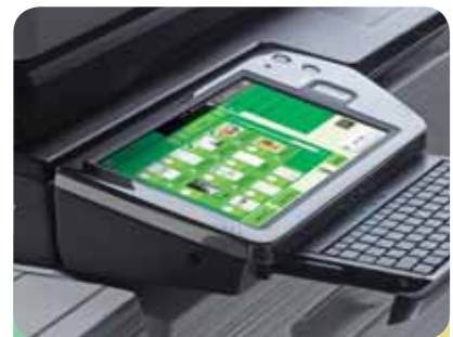
Store and retrieve documents with thumbnail views