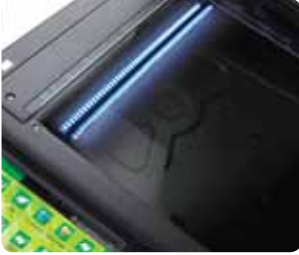
Low-energy LED lights